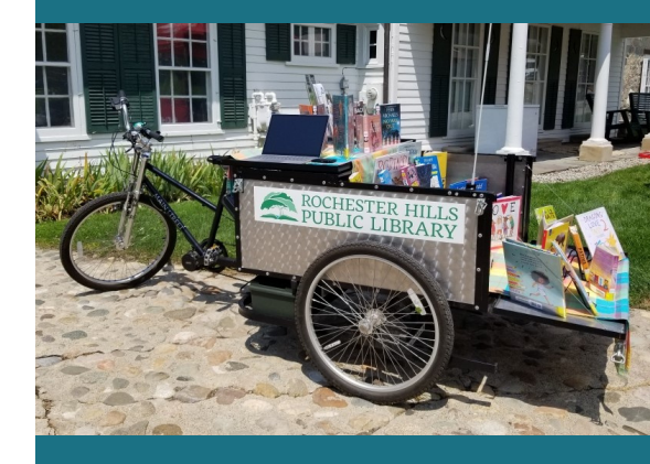
Rochester Hills Public Library's Book Peddler features drop-down shelving for collection and space for a laptop workspace.