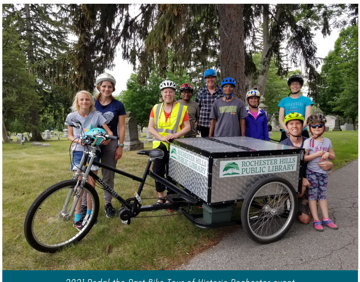
2021 Pedal the Past Bike Tour of Historic Rochester event.

(continued) In September, the Book Peddler joined the City of Rochester and another popular local attraction, Dinosaur Hill, as a stop on the Roll in Rochester event. The bike was parked at nearby Rotary Gateway Park and community members were invited to check out the bike, grab a take-and-make bicycle craft and check out a book or two from the array that we brought along. Our local farmer's market and our very popular Downtown Rochester area where unique shopping and well-known dining establishments attract hundreds of people each day are two other destinations that have proven to be great outreach opportunities for us with the Book Peddler.