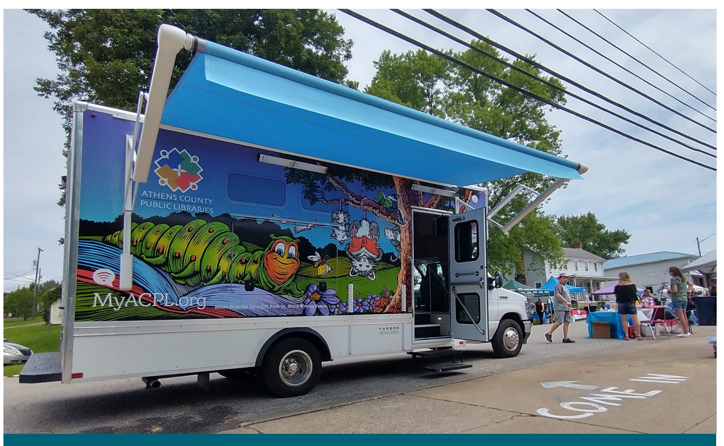
Athens County Public Libraries bookmobile invites patrons to come on board at a community event.